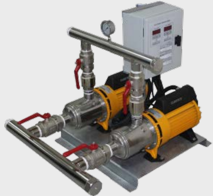
HM Pumpset with Digital Control Panel