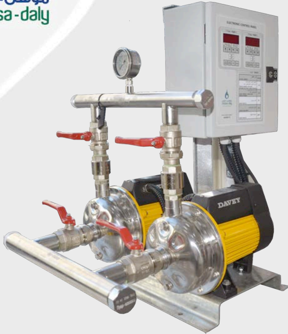
XF Pumpset with Digital Control Panel