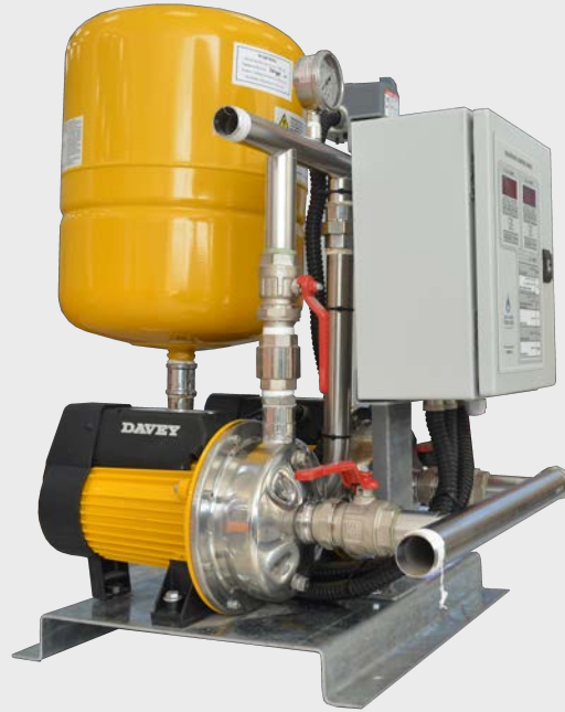
XF Pumpset with Digital Control Panel