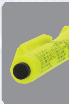
Push-button tail-cap switch