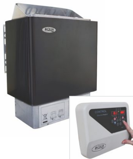
Intelligent Digital Controller