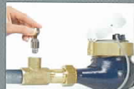
Mount the lock