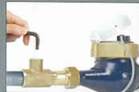
Take the hexagon/pentagon key and shut off the water supply