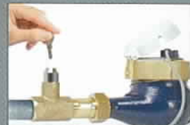
Turn the key and dismount it