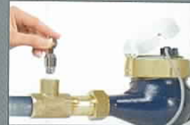
Turn the key and take off the lock