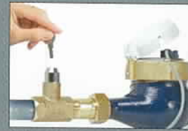
Put on the key