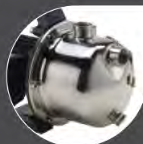
Jet range Pages 64 - 65