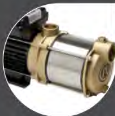
CH range Pages 58 - 59

Over 100 years of unrivalled engineering and technical excellence.