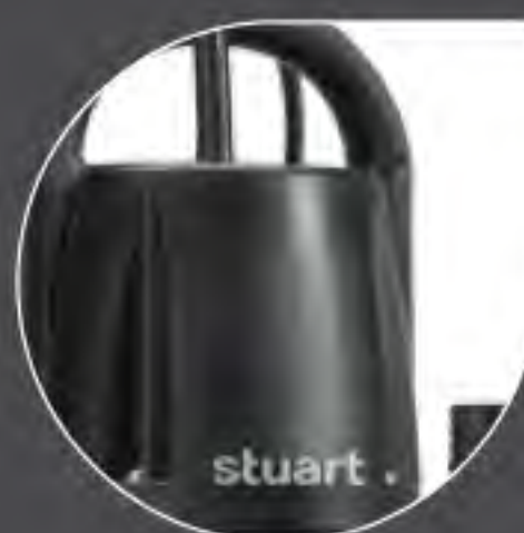
Submersible range Pages 60 - 63